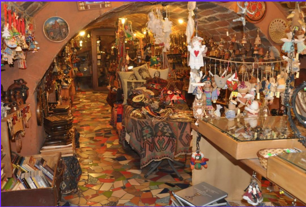
Dalan Souvenir Store